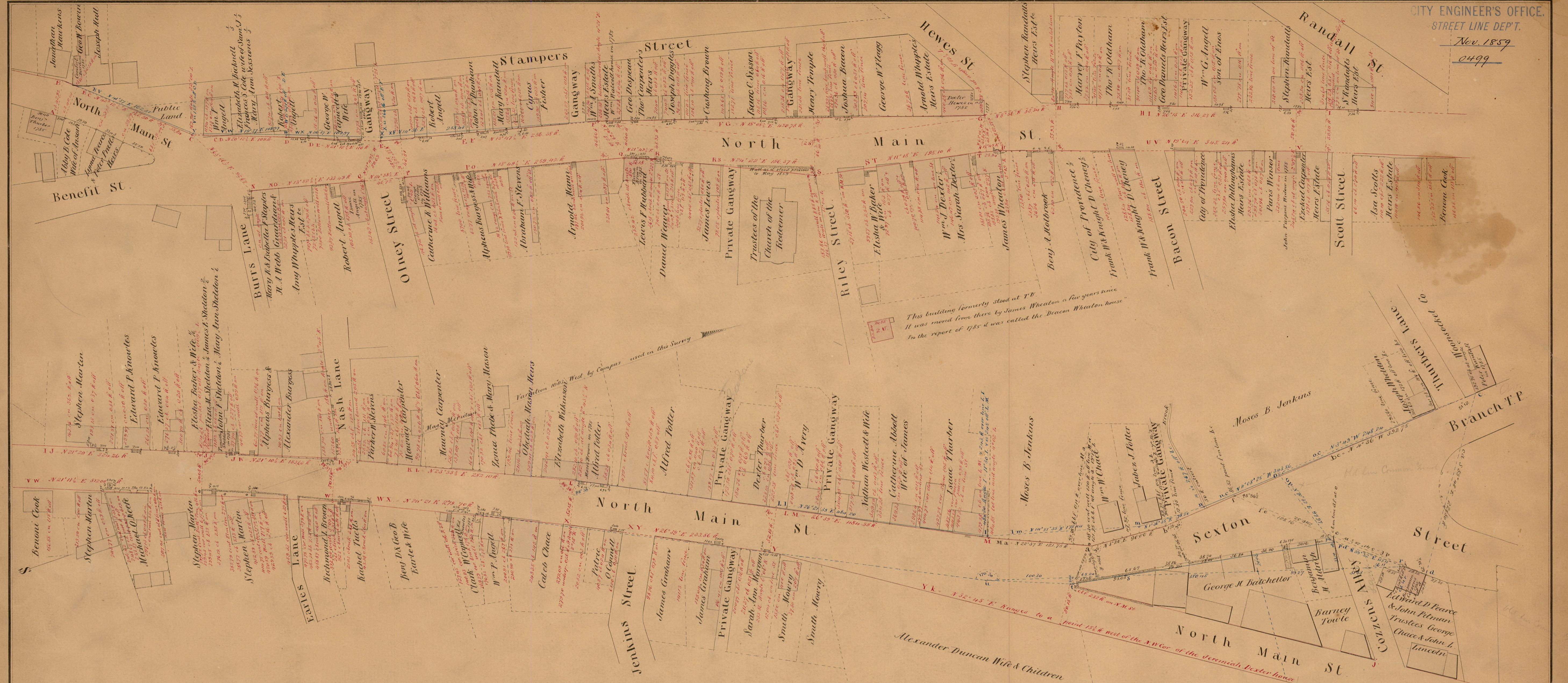
Lines of North Main St. Reported by the STREET COMMISSIONERS IN 1846. The lines, figures &c in blue represent the lines reported - Scale 40 ft. to an inch.